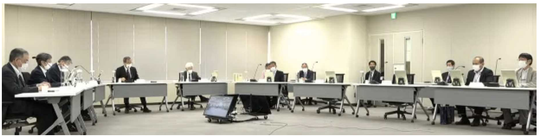
NRA Commission meeting on May 18th 2022

• On 18 May 2022, the NRA Commission approved the Draft Review Results Document to move on to the solicitation of public comments.